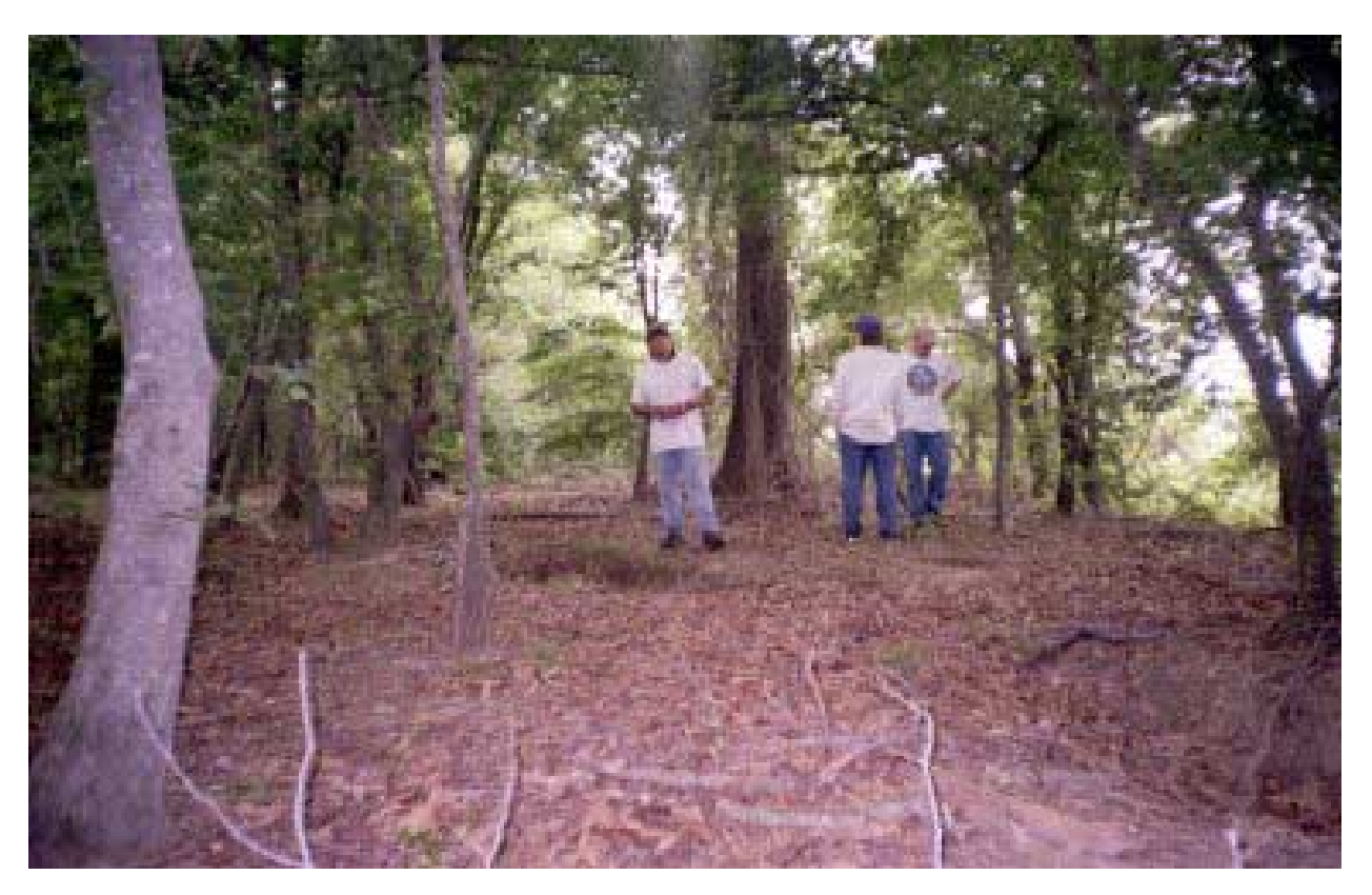
Caddo visiting Lake O' the Pines looted area.