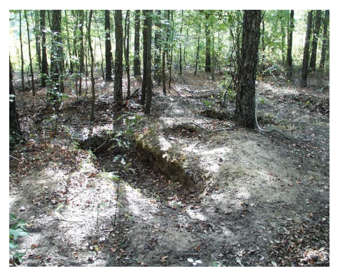
View of looted graves.

history of looting that has taken place on their property. After 50 years of ownership, there is still no formalized cultural resource management plan developed for these east Texas lakes. Pristine archeological sites that were once considered to be eligible for the National Register of Historic Places (NRHP) quickly become ineligible through looting activities, neglect, and natural forces.